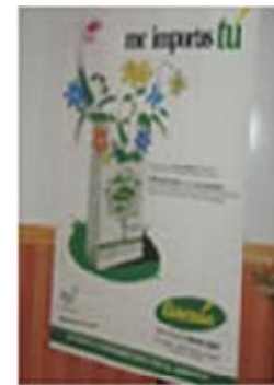
A placard for Hipermercados, Garzón's new bags, above.

Hipermercados Garzón operates six large supermarkets in Venezuela and Panama. EPI looks forward to a long and mutually rewarding relationship with Hipermercados Garzón.