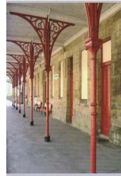
Award Winning Cromford Station, UK.

The revamped Cromford Station is one of the survivors of the old Midland Railway line to Manchester and is the only original station within the Derwent Valley Mills World Heritage Site. Secretary of State for Transport Lord Adonis presented the Railway